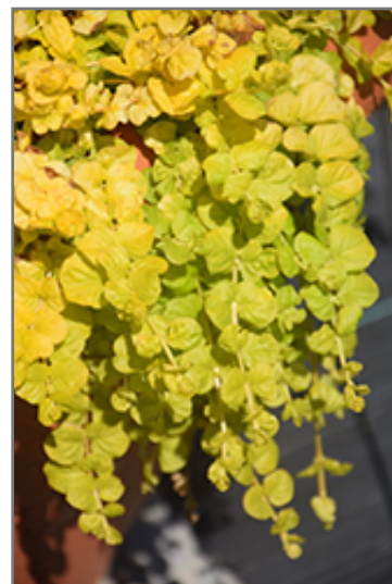
Goldilocks Creeping Jenny foliage

Goldilocks Creeping Jenny is recommended for the following landscape applications;