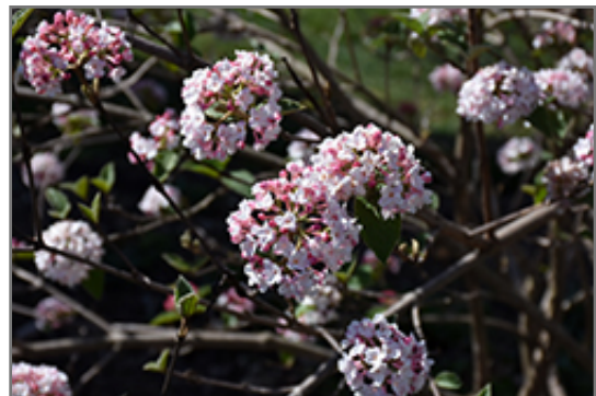
Koreanspice Viburnum flowers