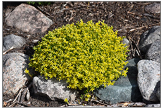
Golden Moss Stonecrop in bloom