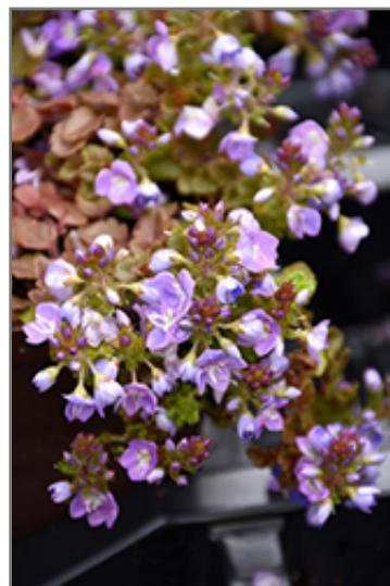
Crystal River Speedwell flowers

Crystal River Speedwell is a fine choice for the garden, but it is also a good selection for planting in outdoor pots and containers. Because of its spreading habit of growth, it is ideally suited for use as a 'spiller' in the 'spiller-thriller-filler' container combination; plant it near the edges where it can spill gracefully over the pot. Note that when growing plants in outdoor containers and baskets, they may require more frequent waterings than they would in the yard or garden.