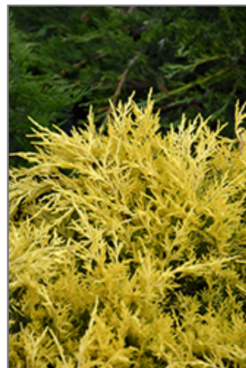
Sea Of Gold Juniper foliage