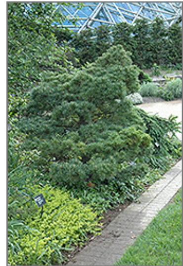
Macopin Eastern White Pine

This shrub should only be grown in full sunlight. It is very adaptable to both dry and moist growing conditions, but will not tolerate any standing water. It is not particular as to soil type, but has a definite preference for acidic soils, and is subject to chlorosis (yellowing) of the foliage in alkaline soils. It is quite intolerant of urban pollution, therefore inner city or urban streetside plantings are best avoided, and will benefit from being planted in a relatively sheltered location. This is a selection of a native North American species.