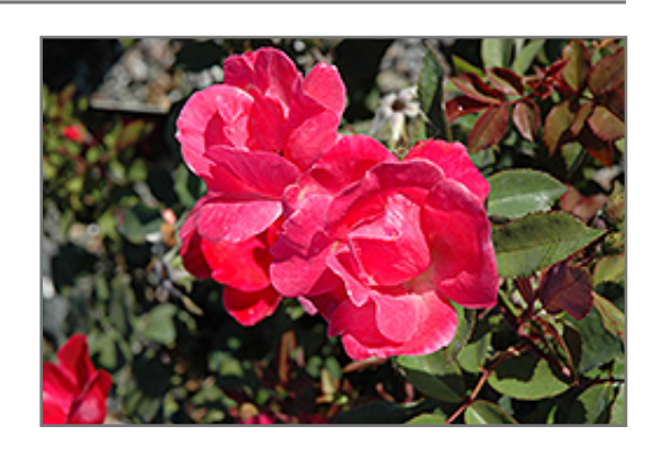
Pink Knock Out Rose flowers