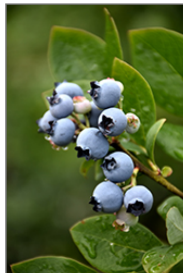
Northblue Blueberry fruit