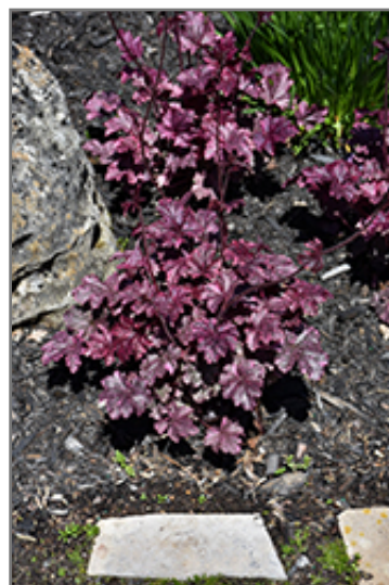
Midnight Rose Coral Bells