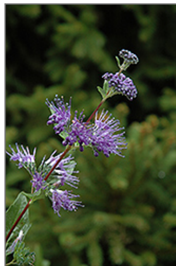
Blue Mist Caryopteris flowers