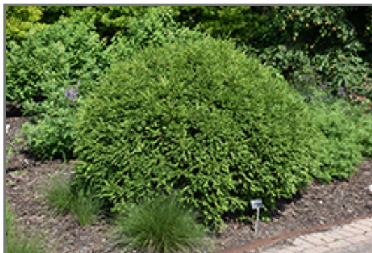
Green Gem Boxwood