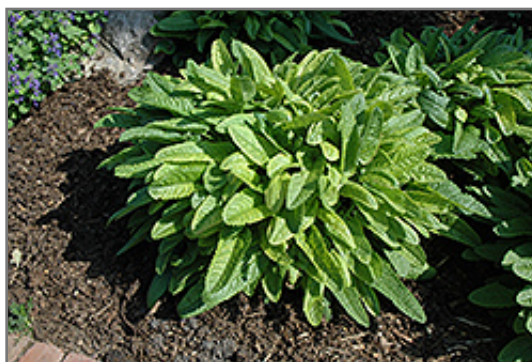
Hummelo Betony