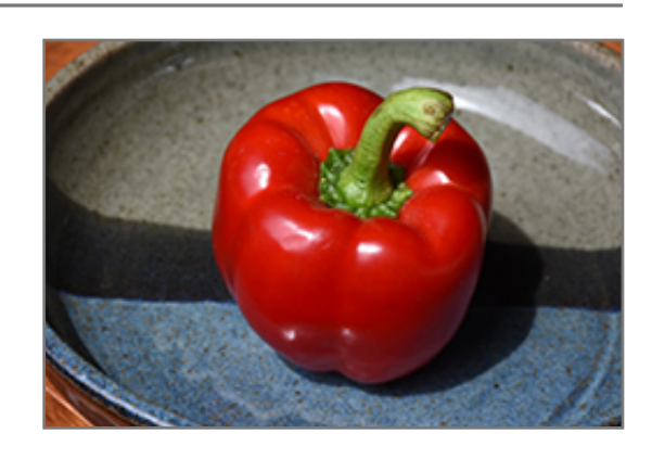
Majestic Red Sweet Pepper fruit

This plant can be integrated into a landscape or flower garden by creative gardeners, but is usually grown in a designated vegetable garden. It should only be grown in full sunlight. It is very adaptable to both dry and moist growing conditions, but will not tolerate any standing water. This plant is a heavy feeder that requires frequent fertilizing throughout the growing season to perform at its best. It is not particular as to soil type or pH. It is somewhat tolerant of urban pollution. This is a selected variety of a species not originally from North America.