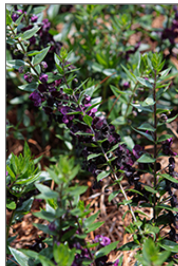
AngelFlare Black Angelonia flowers

AngelFlare Black Angelonia is recommended for the following landscape applications;