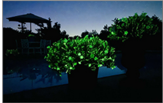
Firefly Petunia flowers