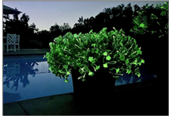
Firefly Petunia flowers

Firefly Petunia is a fine choice for the garden, but it is also a good selection for planting in outdoor containers and hanging baskets. It is often used as a 'filler' in the 'spiller-thriller-filler' container combination, providing a mass of flowers against which the thriller plants stand out. Note that when growing plants in outdoor containers and baskets, they may require more frequent waterings than they would in the yard or garden.