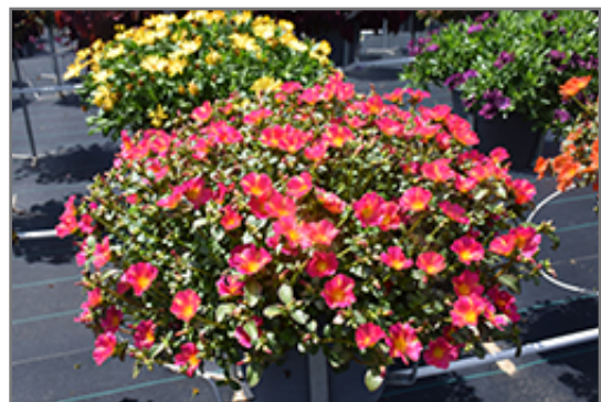
Mega Pazzaz Pink Twist Portulaca in bloom