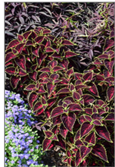
Talavera Pink Tricolor Coleus