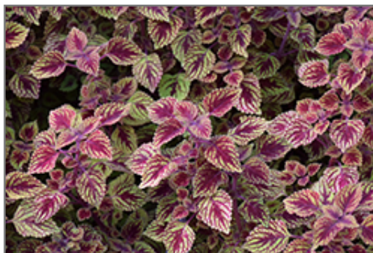
Great Falls Rose Gold Coleus foliage

Great Falls Rose Gold Coleus is recommended for the following landscape applications;