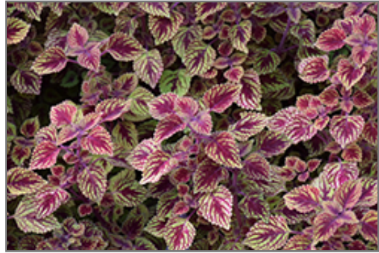
Great Falls Rose Gold Coleus foliage

Great Falls Rose Gold Coleus is recommended for the following landscape applications;