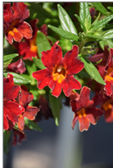
Mai Tai Red Monkeyflower flowers