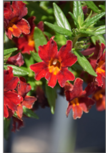
Mai Tai Red Monkeyflower flowers