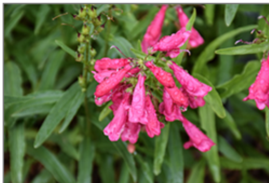
Coral Baby Beardtongue flowers