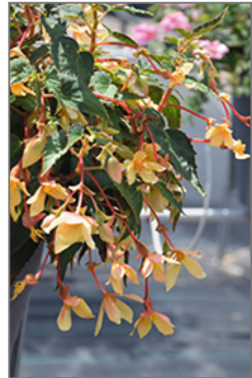
Beauvilia Yellow Begonia flowers