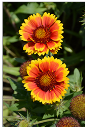
Arizona Sun Blanket Flower flowers

Arizona Sun Blanket Flower is recommended for the following landscape applications;