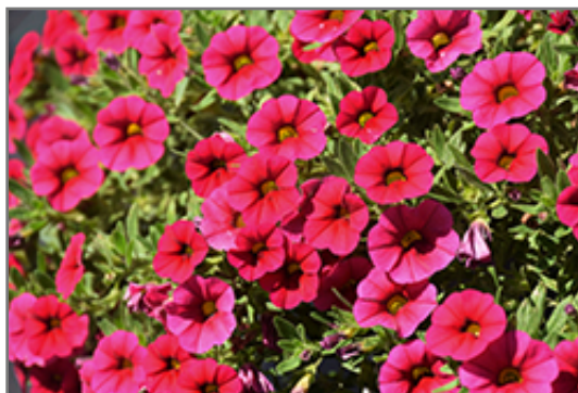
Cabaret Hot Rose Calibrachoa flowers