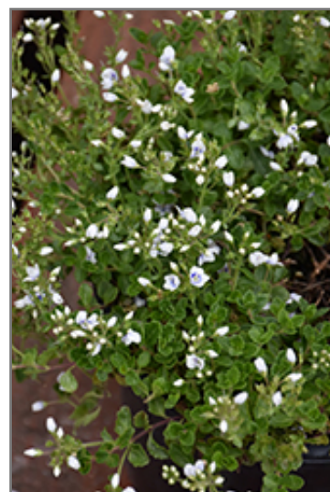
Snowmass Blue-Eyed Veronica flowers

Snowmass Blue-Eyed Veronica is recommended for the following landscape applications;