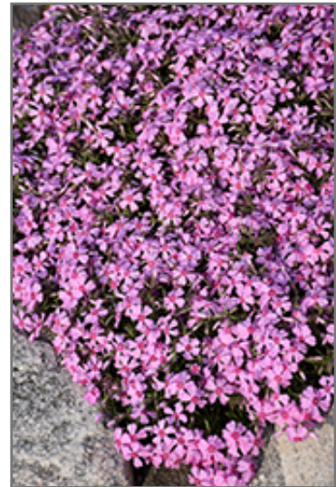
Eye Candy Creeping Phlox in bloom

Eye Candy Creeping Phlox is recommended for the following landscape applications;