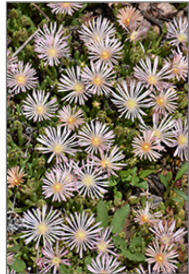
Alan's Apricot Ice Plant flowers