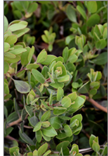
Chieftain Manzanita foliage

This shrub does best in full sun to partial shade. You may want to keep it away from hot, dry locations that receive direct afternoon sun or which get reflected sunlight, such as against the south side of a white wall. It is very adaptable to both dry and moist growing conditions, but will not tolerate any standing water. It is considered to be drought-tolerant, and thus makes an ideal choice for a low-water garden or xeriscape application. This plant should be periodically fertilized throughout the active growing season with a specially-formulated acidic fertilizer. It is very fussy about its soil conditions and must have sandy, acidic soils to ensure success, and is subject to chlorosis (yellowing) of the foliage in alkaline soils, and is able to handle environmental salt. It is somewhat tolerant of urban pollution. This particular variety is an interspecific hybrid.