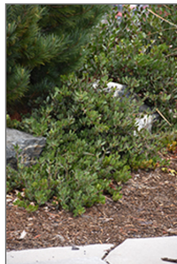
Chieftain Manzanita

Chieftain Manzanita is recommended for the following landscape applications;