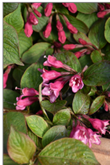
Midnight Sun Reblooming Weigela flowers

Midnight Sun Reblooming Weigela makes a fine choice for the outdoor landscape, but it is also well-suited for use in outdoor pots and containers. It is often used as a 'filler' in the 'spiller-thriller-filler' container combination, providing a mass of flowers and foliage against which the thriller plants stand out. Note that when grown in a container, it may not perform exactly as indicated on the tag - this is to be expected. Also note that when growing plants in outdoor containers and baskets, they may require more frequent waterings than they would in the yard or garden.