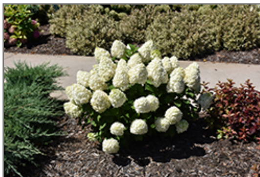
Little Lime Punch Hydrangea in bloom

Little Lime Punch Hydrangea makes a fine choice for the outdoor landscape, but it is also well-suited for use in outdoor pots and containers. With its upright habit of growth, it is best suited for use as a 'thriller' in the 'spiller-thriller-filler' container combination; plant it near the center of the pot, surrounded by smaller plants and those that spill over the edges. It is even sizeable enough that it can be grown alone in a suitable container. Note that when grown in a container, it may not perform exactly as indicated on the tag - this is to be expected. Also note that when growing plants in outdoor containers and baskets, they may require more frequent waterings than they would in the yard or garden.