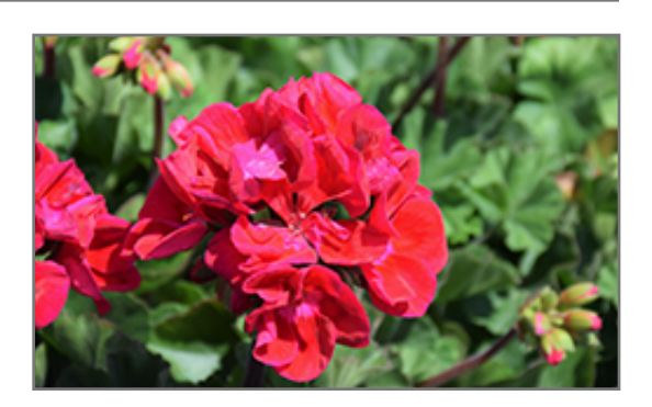
Mojo Cranberry Splash Geranium flowers

An outstanding series ideal for container and combination planting; dark green foliage set the backdrop for bold and brightly colored flowers to take center stage; well branched, upright mounded habit; remove spent flowers to encourage new blooms