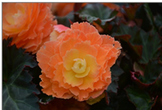
I'Conia Miss Miami Begonia flowers

I'Conia Miss Miami Begonia is recommended for the following landscape applications;