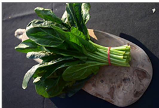
Olympia Spinach fruit

This plant is typically grown in a designated vegetable garden. It does best in full sun to partial shade. It does best in average to evenly moist conditions, but will not tolerate standing water. This plant should not require much in the way of fertilizing once established, although it may appreciate a shot of general-purpose fertilizer from time to time early in the growing season. It is not particular as to soil pH, but grows best in rich soils. It is somewhat tolerant of urban pollution. Consider applying a thick mulch around the root zone over the growing season to conserve soil moisture. This is a selected variety of a species not originally from North America.