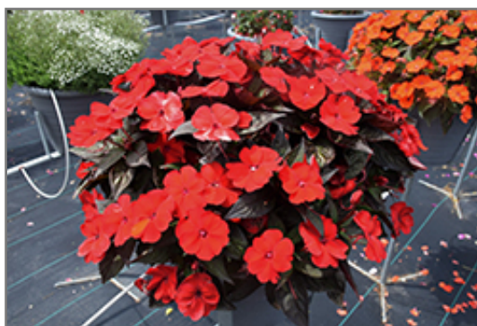
SunPatiens Compact Deep Red Impatiens in bloom