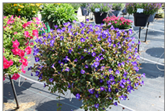
Summer Wave Bouquet Deep Blue Torenia in bloom