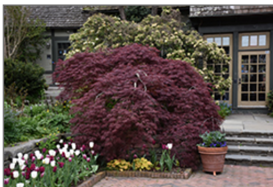
Tamukeyama Japanese Maple