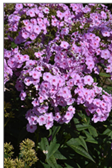
Luminary Opalescence Garden Phlox flowers

Luminary Opalescence Garden Phlox is recommended for the following landscape applications;