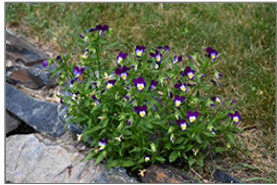
Johnny Jump-Up in bloom

Johnny Jump-Up will grow to be only 4 inches tall at maturity extending to 6 inches tall with the flowers, with a spread of 6 inches. When grown in masses or used as a bedding plant, individual plants should be spaced approximately 5 inches apart. It grows at a fast rate, and tends to be biennial, meaning that it puts on vegetative growth the first year, flowers the second, and then dies. However, this species tends to self-seed and will thereby endure for years in the garden if allowed. As an herbaceous perennial, this plant will usually die back to the crown each winter, and will regrow from the base each spring. Be careful not to disturb the crown in late winter when it may not be readily seen!