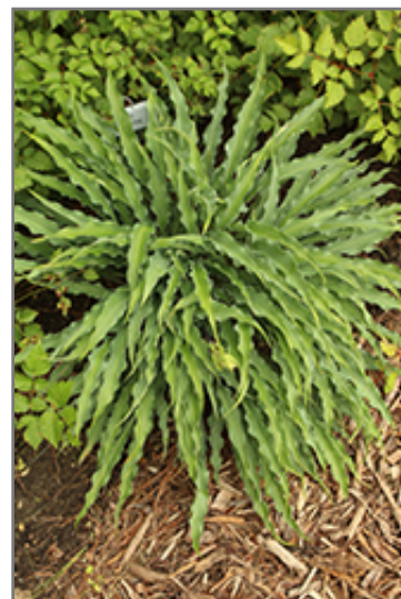
Silly String Hosta

Silly String Hosta is recommended for the following landscape applications;