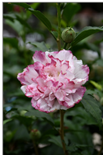
Danica Rose of Sharon flowers