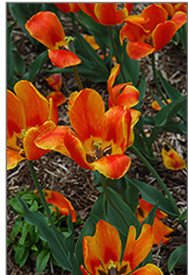
Flair Tulip flowers