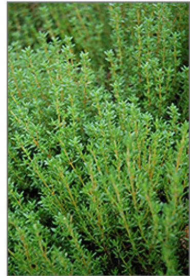
Common Thyme foliage