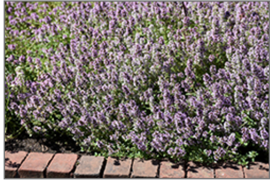
Common Thyme in bloom