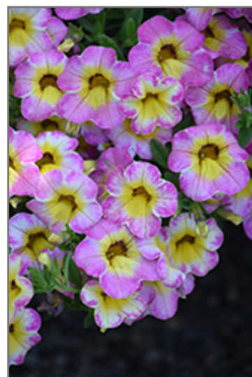
Cha-Cha Diva Hot Pink Calibrachoa flowers