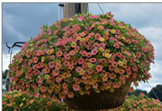
Cha-Cha Diva Apricot Calibrachoa in bloom