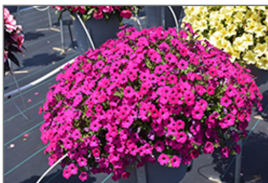
Itsy Magenta Petunia in bloom