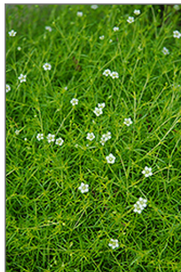
Scotch Moss flowers

Scotch Moss will grow to be only 1 inch tall at maturity, with a spread of 12 inches. Its foliage tends to remain low and dense right to the ground. It grows at a medium rate, and under ideal conditions can be expected to live for approximately 10 years. As an evergreen perennial, this plant will typically keep its form and foliage year-round.