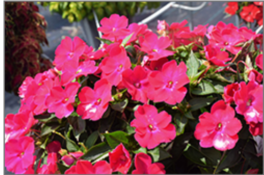
SunPatiens Compact Rose Glow New Guinea Impatiens flowers

SunPatiens Compact Rose Glow New Guinea Impatiens is recommended for the following landscape applications;