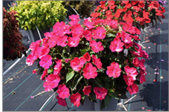
SunPatiens Compact Rose Glow New Guinea Impatiens in bloom

SunPatiens Compact Rose Glow New Guinea Impatiens will grow to be about 24 inches tall at maturity, with a spread of 24 inches. When grown in masses or used as a bedding plant, individual plants should be spaced approximately 20 inches apart. Its foliage tends to remain dense right to the ground, not requiring facer plants in front. This fast-growing annual will normally live for one full growing season, needing replacement the following year.