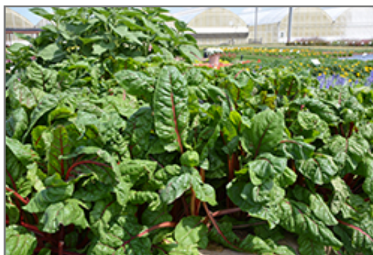
Ruby Red Swiss Chard