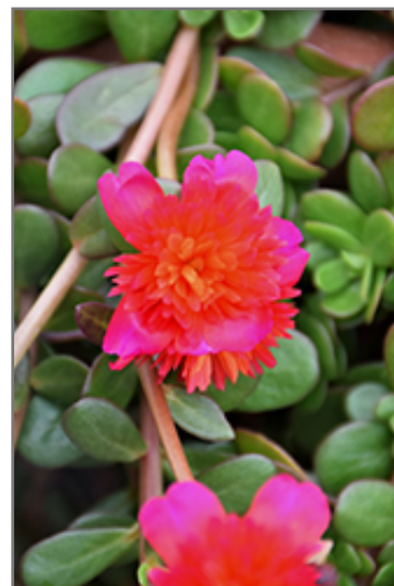
ColorBlast Double Magenta Portulaca flowers

ColorBlast Double Magenta Portulaca is recommended for the following landscape applications;