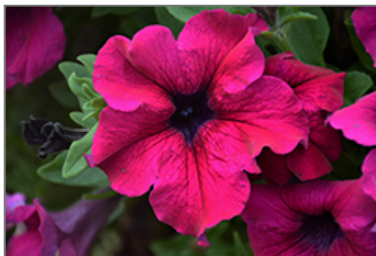
Sanguna Mega Purple Petunia flowers

Sanguna Mega Purple Petunia is recommended for the following landscape applications;