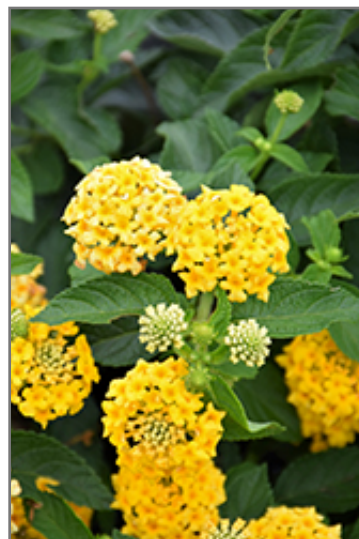
Landscape Bandana Yellow Lantana flowers